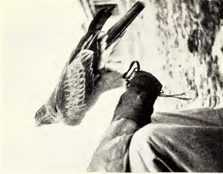
THE BOOTED EAGLE ( Hieraetus pennatus )